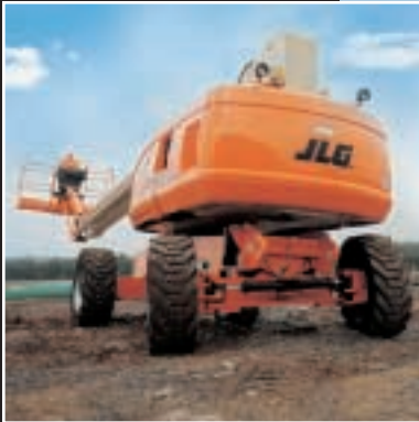
Jobsite Proven Performance