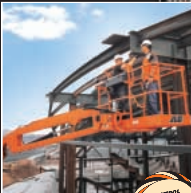
750 lbs. Capacity with JIB