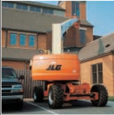
Narrow Fixed Width - Low GVW